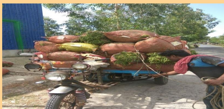
Farmers crying Brahmi to Drying unit at Bokkhali

Kalpataru Women SHGs are engaged in the line of activity from the year 2011. We have set up a Soft toys manufacturing unit at Vill: Kanchanpur, Hingalganj, in North 24 Pgs District. 40 women are from Barasat and Hingaleganj block manufacturing soft toys and were able to earn regular basis. We have some trainers to train, supervisors and expert sales man in this line.