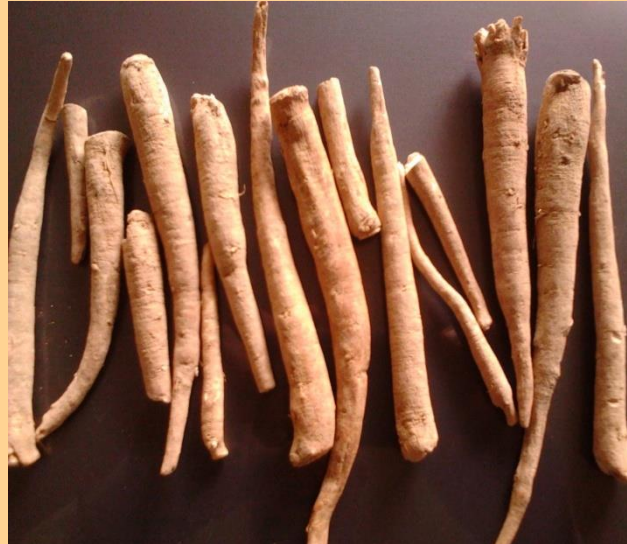
Dry Aswagandha Roots