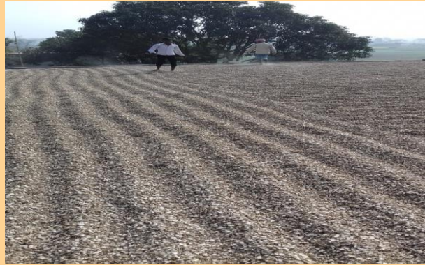
KAPOOR KACHARI(Hedychium Spicatum)