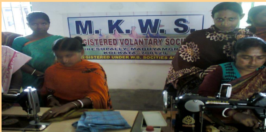
During SHG & Soft Toys Training Programme