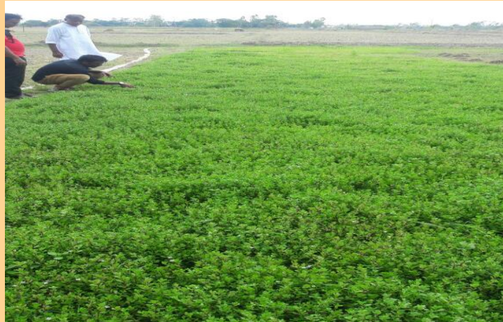
Bacopa firming by KBC in 150 acre of land at Bokkhali