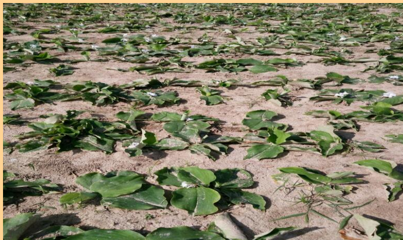
Kapoor Kachari cultivation by the cluster members at Murshidabad