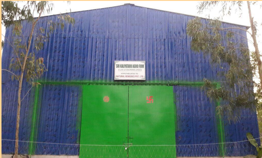
Drying shed of Kalpataru Bacopa Cluster